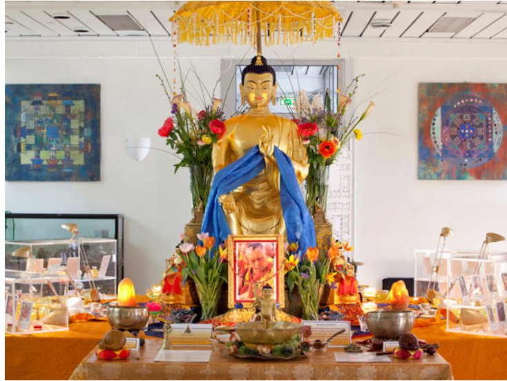
Footage from Oslo, Taiji Center in Norway. There follows below, more information about some of the relics presently in the collection:

— Lama Zopa Rinpoche, Spiritual Director of Maitreya Project